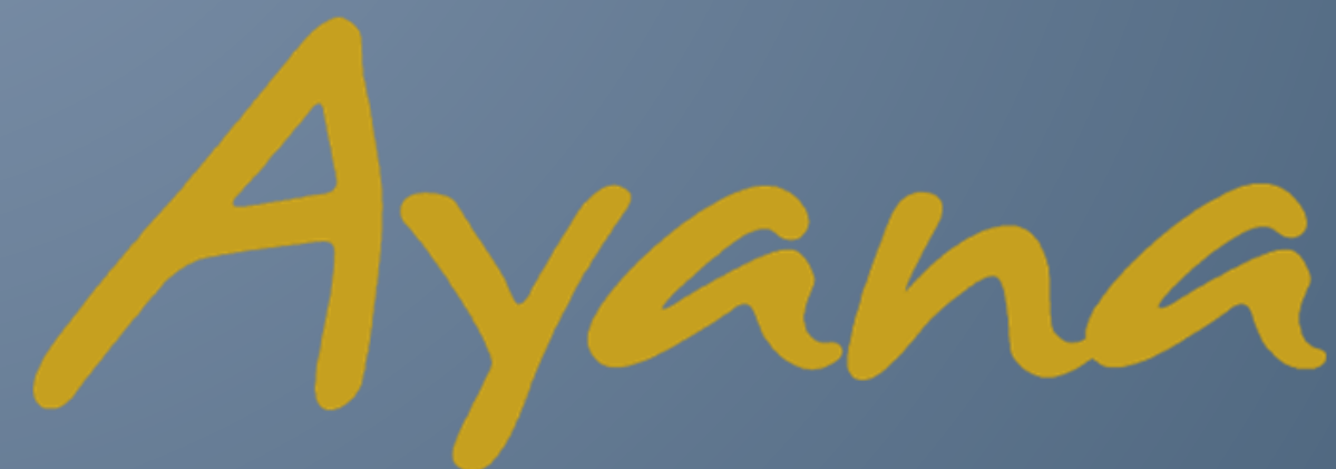
Fontana (Ayana Farm)